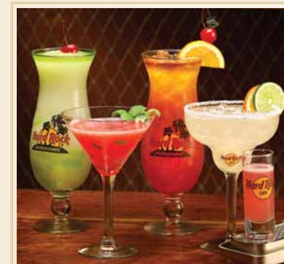
Available in our souvenir glassware for a little extra.

Bass Ale Blue Point Toasted Lager Dogfish Head 60 min IPA Corona Extra Corona Light Heineken Heineken Light Sam Adams Seasonal Bud Light Bud Light Lime Budweiser Michelob Ultra Rolling Rock O'Doul's (non-alcoholic)